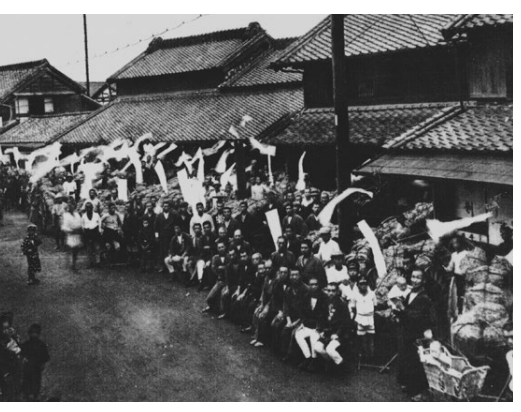
Kawagoe fruit and vegetables market (circa 1904)

While an increasing number of farmers in Kawagoe are struggling with succession problems, there are still many