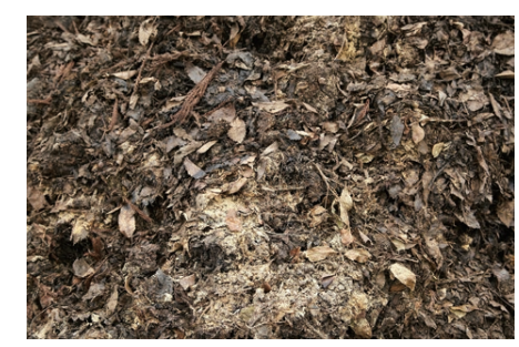
Leaves and other materials are turned into compost over the course of about a year.