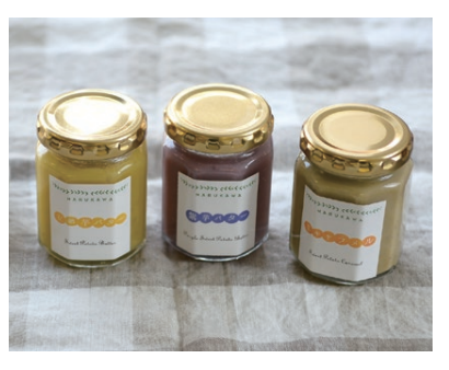
Products made from local produce

who have been in business for more than a dozen generations, and the number of new farmers is also increasing.