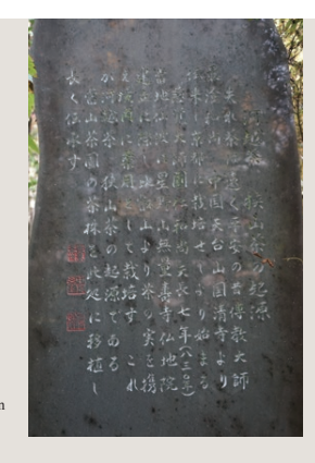
Monument at Nakain Temple

the area from the Sayama Hills to the Kaji Hills. Sayama's Uji-style production process was established and tea production flourished.