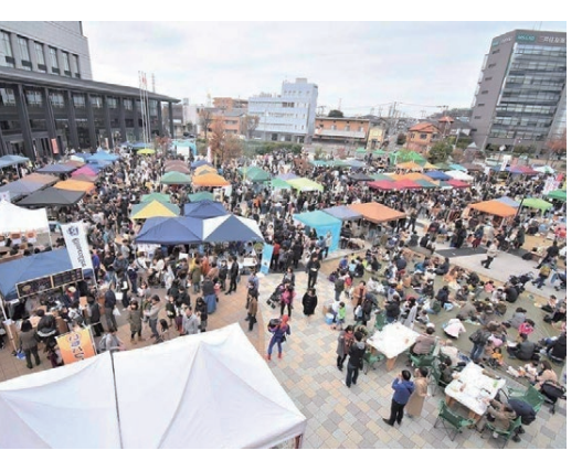
Farmers' market (2019)